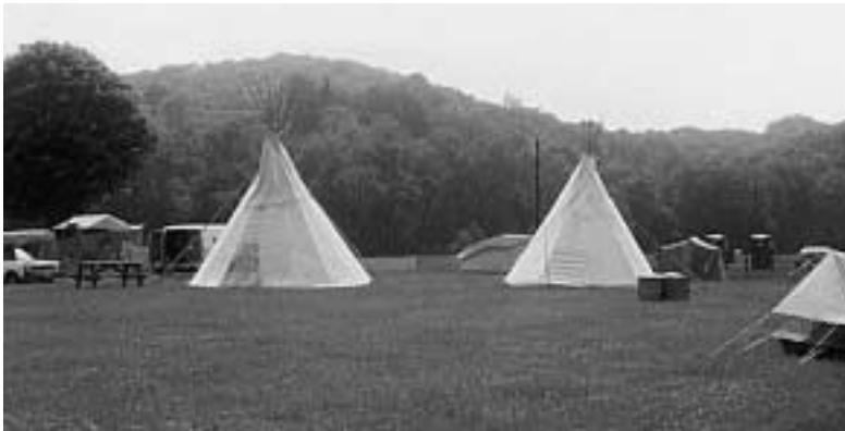
"In the good old days!" Campers had their run of the park.